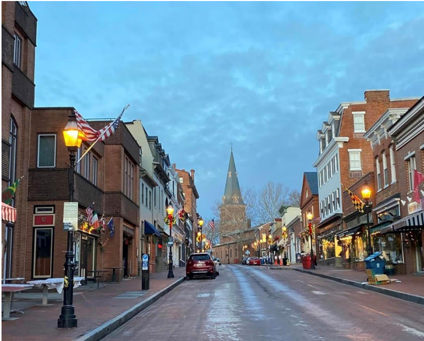
A Beautiful morning in Annapolis!

You must have your blue name tag order to Bruce by 16 March 2024.