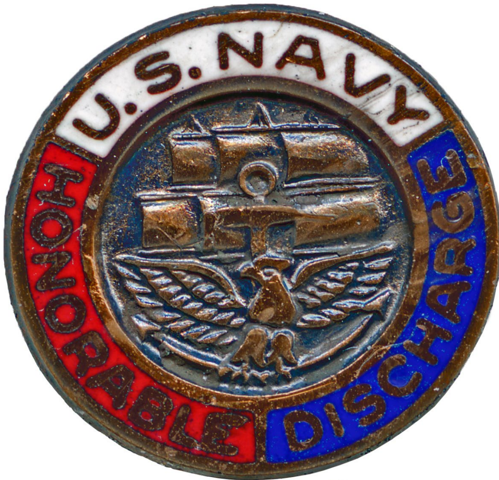
Lapel pin awarded upon Honorable Discharge - 1976