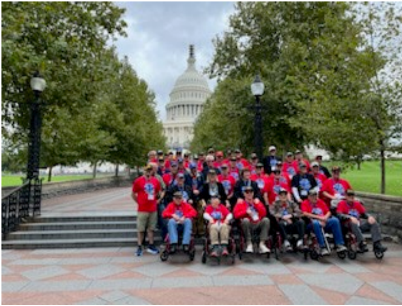
With the Washington DC Honor Flight from Reno